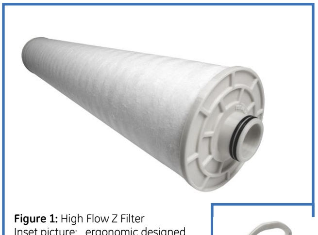
Inset picture: ergonomic designed handle for easy replacement