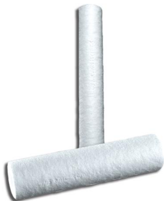
Figure 1 : Hytrex Depth Cartridge Filters